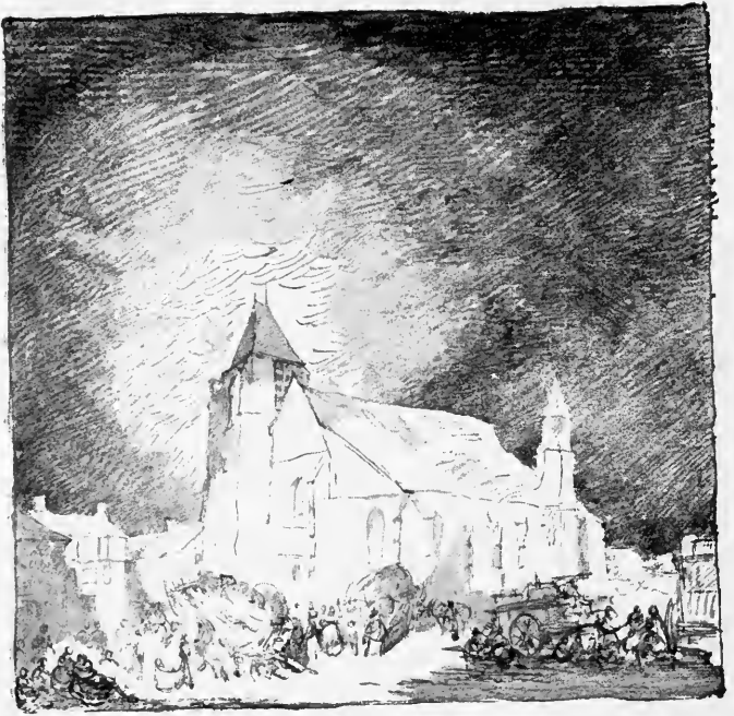
ONE BY ONE THE TOWNS AND VILLAGES HAD BEEN BOMBARDED, LOOTED AND BURNED [Page 126]